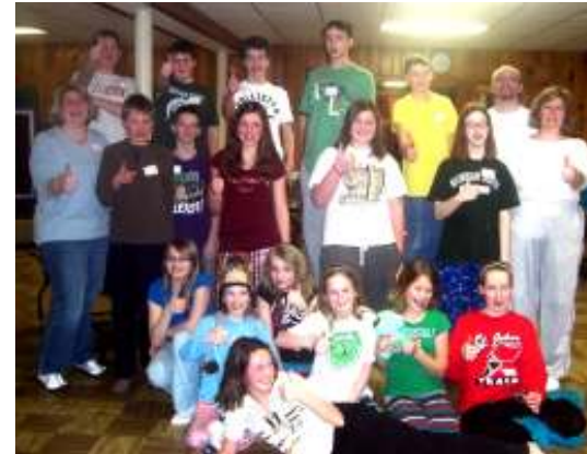
The Jr. High P.F. enjoyed a lock-in at the church on February 12-13th. There were 13 PFers and 4 of their friends who joined the fun. A great time was had by all!