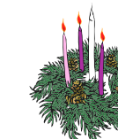
Fourth Sunday of Advent