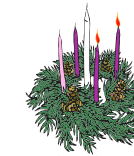
Second Sunday of Advent