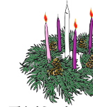
Third Sunday of Advent